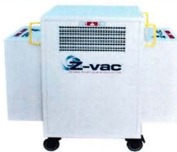
Z-vac Model: Z23002